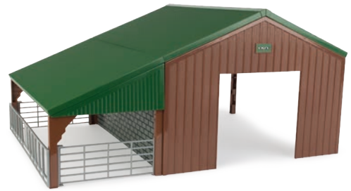
NEW 2019 1:32 Dual Purpose Building Part No. ZFN46961 Age grade 5+