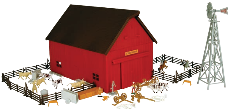
1:64 Western Barn Set Part No. ZFN12278 Age grade 5+