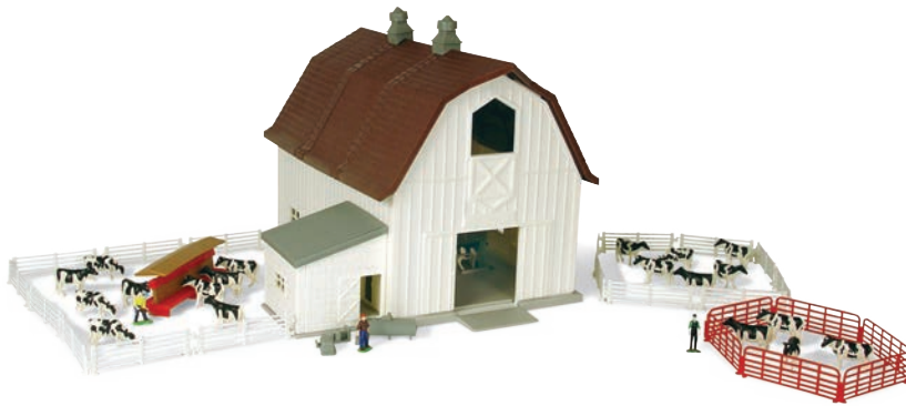
1:64 Dairy Barn Set Part No. ZFN12279 Age grade 5+