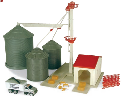
1:64 Grain Elevator Set Part No. ZFN12924 Age grade 5+