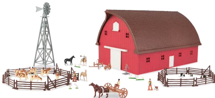
1:64 Farm Country Gable Barn Part No. ZFN46765 Age grade 5+