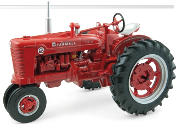
1:16 Farmall® Super MD Part No. ZFN14867 Age grade 3+ Die-cast body, narrow front axle, and clam shell fenders.