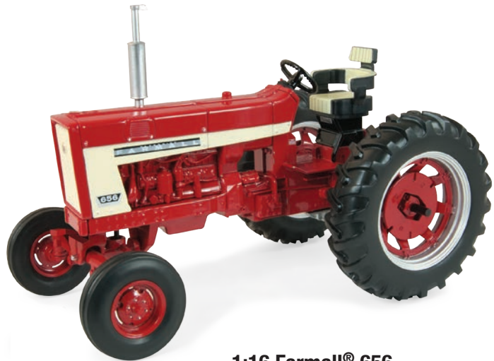
1:16 Farmall® 656 Part No. ZFN14886 Age grade 3+ Die-cast body, wide front axle.