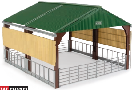
NEW 2019 1:32 Livestock Building Part No. ZFN46959 Age grade 5+