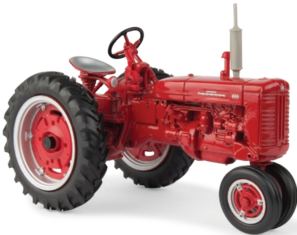
1:16 Farmall® 200 Part No. ZFN44104 Age grade 3+ Die-cast body and narrow front axle. Soft feel tires.