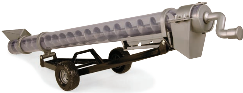
1:16 Grain Auger Part No. ZFN12948 Age grade 3+ Die-cast frame.